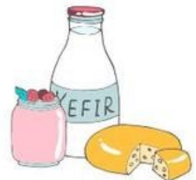
dairy products (yogurt, kefir, aged cheeses)