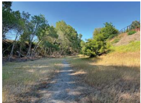
Old Alameda Creek restoration vision; current creek conditions.