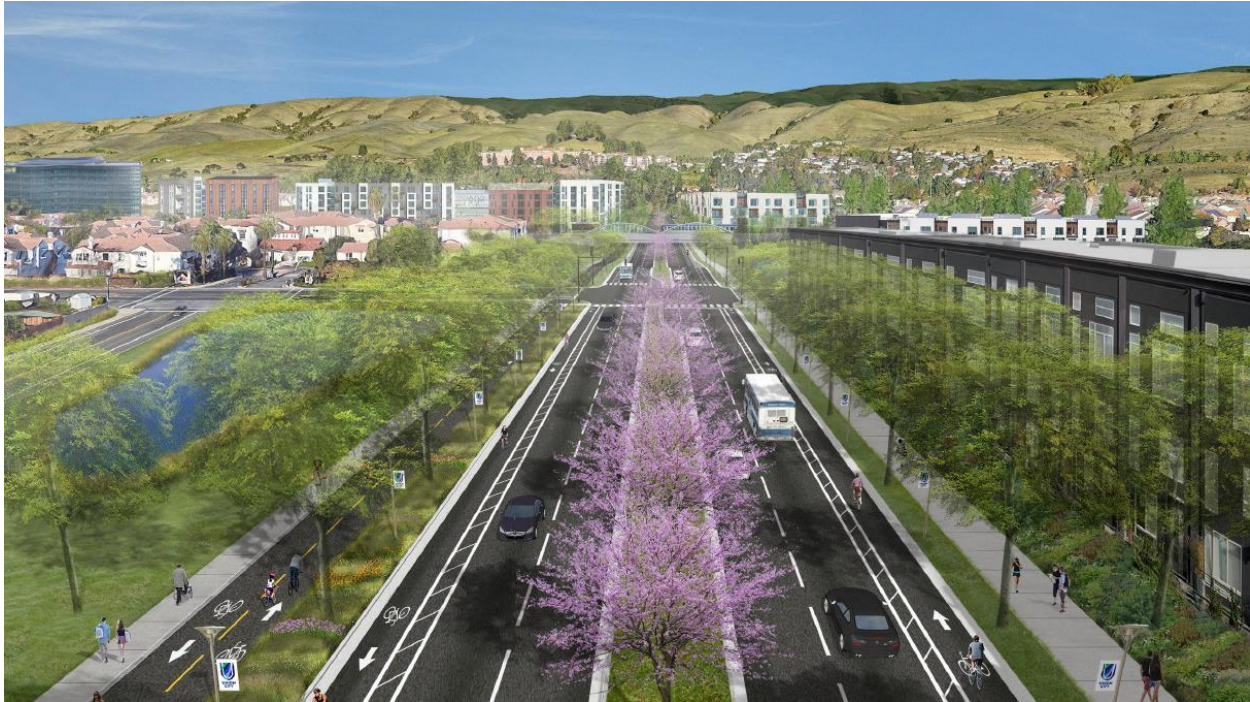
Rendering of Quarry Lakes Parkway

Union City is pleased to provide a progress report on the Quarry Lakes Parkway Project. Quarry Lakes Parkway (QLP) has transformed from the East West Connector “expressway” to a local complete streets project that will provide buffered Class II bicycle lanes adjacent to vehicle lanes, a separated 20-ft. Class I multi-use trail for both bicycles and pedestrians with landscaped walkways and medians, traffic calming, bus stops, and mobility enhancements. Quarry Lakes Parkway will include continuous bicycle and pedestrian trails and new opportunities for connecting to regional trails; new bus routes for Union City Transit and other transit providers; and mobility hubs that could include electric car recharge facilities. Utilities and high-speed fiber conduits will be placed within the Quarry Lakes Parkway right-of-way to better serve residents. Most importantly, Quarry Lakes Parkway will provide a critical arterial for Fremont and Union City residents, and first responders accessing the transit hub and high-density development planned for the Station District. More information on Quarry Lakes Parkway can be found here .